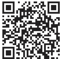
St Denis' church

In spring the churchyard is full of wild flowers, including Star of Bethlehem, snowdrops, orchids, primroses and cowslips, which happily grow with abundance in East Hatley. A local management team keeps an eye on the building and ensures the churchyard is kept tidy.