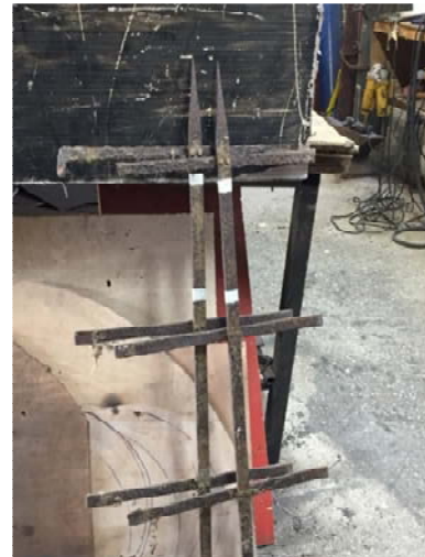
Window ironwork cleaned, painted then stainless steel tips are welded onto each end ready for insertion into the stonework