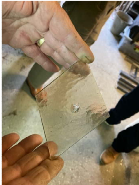
We believe this pane was damaged by an air pistol bullet