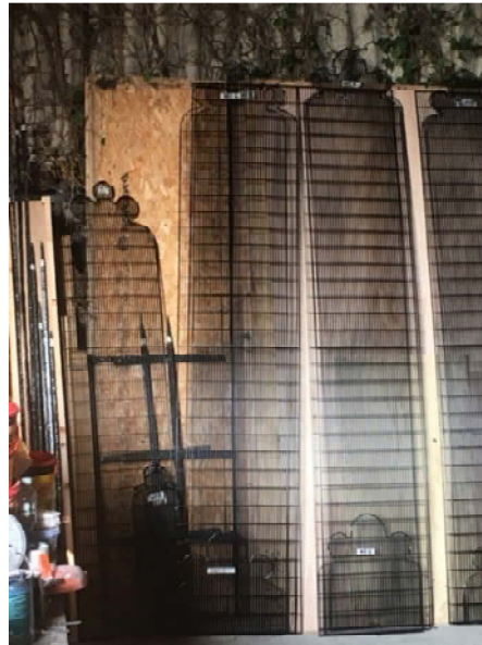
Powder coated stone guards ready for installation

Most of our windows are now complete and will be returned for re-fitting later this week. Alec Hissett.