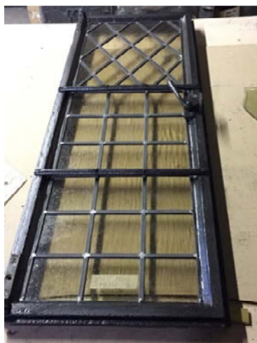
North porch window ready for glazing