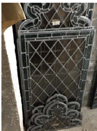
Completed windows ready for delivery