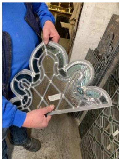
Our host explaining that some of our windows were too small leaving a gap at the top. They needed additional lead added to the top profile to fill the gap