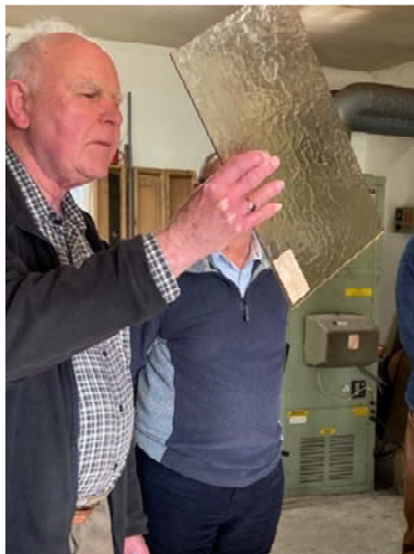
Sheet of glass matching the cracked/broken panes in our windows